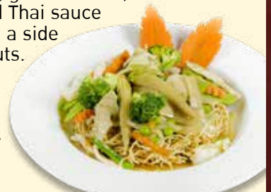
#35 EMPEROR NOODLE

Glass noodles stir-fried with shrimp, chicken, an egg, green onions, bean sprouts and Pad Thai sauce and served with a side of ground peanuts.