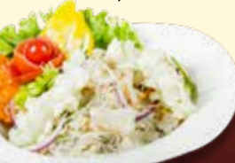
#28 GLASS NOODLE SALAD

Seafood combination with tomatoes, cucumbers, and onions mixed with a chili paste dressing on a bed of fresh green salad.