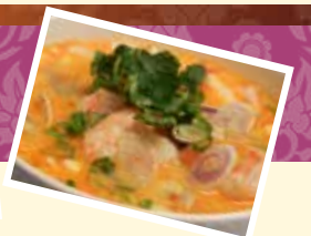
#19 TOM KHA GOONG