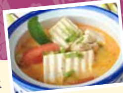
TOM KHA TOFU